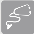
Mobile Physician Rounding